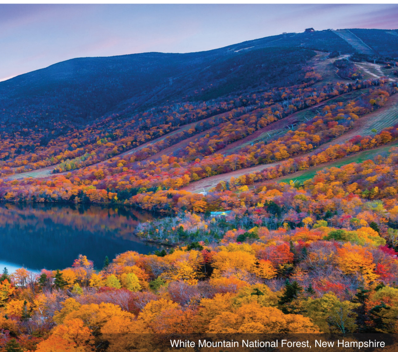
White Mountain National Forest, New Hampshire