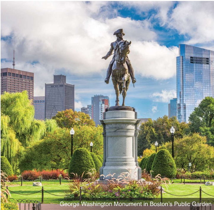
George Washington Monument in Boston's Public Garden