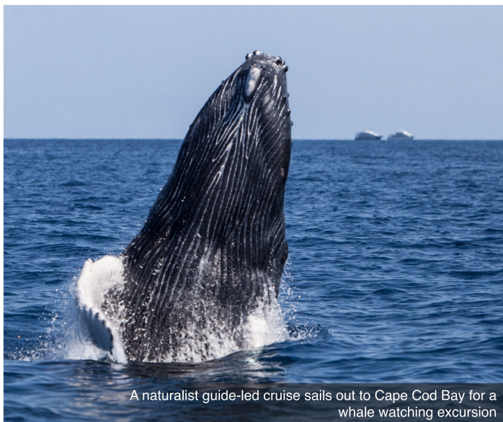
A naturalist guide-led cruise sails out to Cape Cod Bay for a whale watching excursion

DAY 9 Travel Home: This morning, take the group transfer to Boston's Logan Airport for flights out after 12:00 p.m. Meal: B